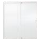
Dining to Future Deck III