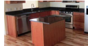
Kitchen Tops (not color, but style)

Location: Kitchen Style: Granite Color: New Caledonia Edge Detail: Pencil Edge Cut-Outs: Undermount Sink Backsplash: Yes B/S Location: Back only.