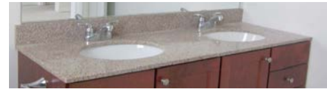
Master Bath Top