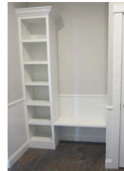
Mudroom Bench and Cubbies