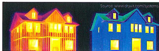
Before and after continuous insulation

Applying a layer of insulation on the outside (most typical) or inside of the stud wall essentially forms a continuous blanket (also known as a "thermal break") around the home. This leads to greater comfort, warmer walls, and reduced heat loss and air leakage. Plus, it's a great way to reduce sound transmission through walls.