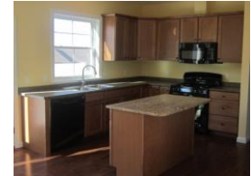
Kitchen Tops (not color, but style)

Location: Kitchen Surround Style: Laminate Color: Perlato Granite #3522-46 Edge Detail: E-2000 Cut-Outs: Self-rimming sink. Backsplash: Yes B/S Location: Back only.