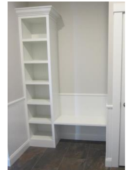
Mudroom Bench and Cubbies

Built-Ins: Bench and Cubbies at Mudroom Coat Pegs at Mudroom