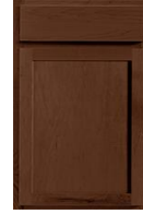
Kitchen & Master Bath

Kitchen Cabinets to be Mid Continent Pro Series All kitchen cabinets are Copeland style in Stained Birch, color to be "Fireside" Bath Vanity Cabinets to be Mid Continent Pro Series Master Bath Vanity to be Copeland style in Stained Birch, color to be "Fireside" Bath #2 Vanity to be Copeland style in Stained Birch, color to be "Sundance" Bath Vanities are 34 1/2" Tall Cabinet plans are drawn and presented to the client before cabinet construction begins. **Photos are meant to show cabinet style only, actual color may vary