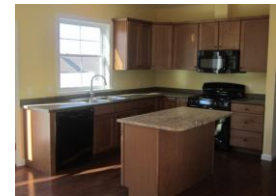
Kitchen Tops (not color, but style)