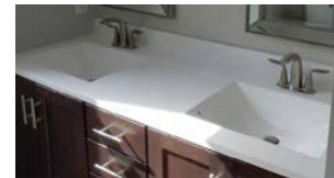
Master Bath Top

Location: Master Bathroom 72" vanity Style: Cultured Marble with integrated flush rectangular bowls Color: Cotton White Edge Detail: Square Edge Cut-Outs: None Backsplash: Yes B/S Location: Back only.