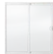
Lower Level Entry IV