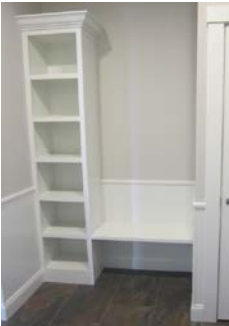
Mudroom Bench and Cubbies

Built-Ins: Bench and Cubbies at Mudroom Coat Pegs at Mudroom Closet