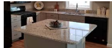
Kitchen Tops (not color, but style)

Location: Kitchen Surround Style: Granite - Builder Series Color: To Be Selected by Owner Edge Detail: Pencil Edge Cut-Outs: Undermount Sink Backsplash: Yes B/S Location: Back only.