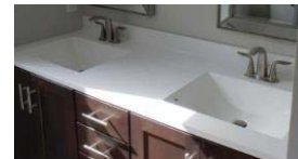
Master Bath Top