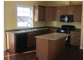
Kitchen Tops (not color, but style)