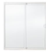
Future Deck III