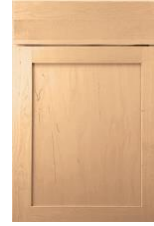
Concord Maple "Natural Finish"

Kitchen Cabinets to be Mid Continent Simple Series All kitchen cabinets are Concord style in Maple with "Natural" finish Vanity Cabinets to be Mid Continent Simple Series All vanity cabinets are Concord style in Maple with "Natural" finish