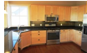
Kitchen Tops (not color, but style)

Location: Kitchen Style: Granite Color: New Caledonia Edge Detail: Pencil Edge Cut-Outs: Undermount Sink Backsplash: Yes B/S Location: Back only.