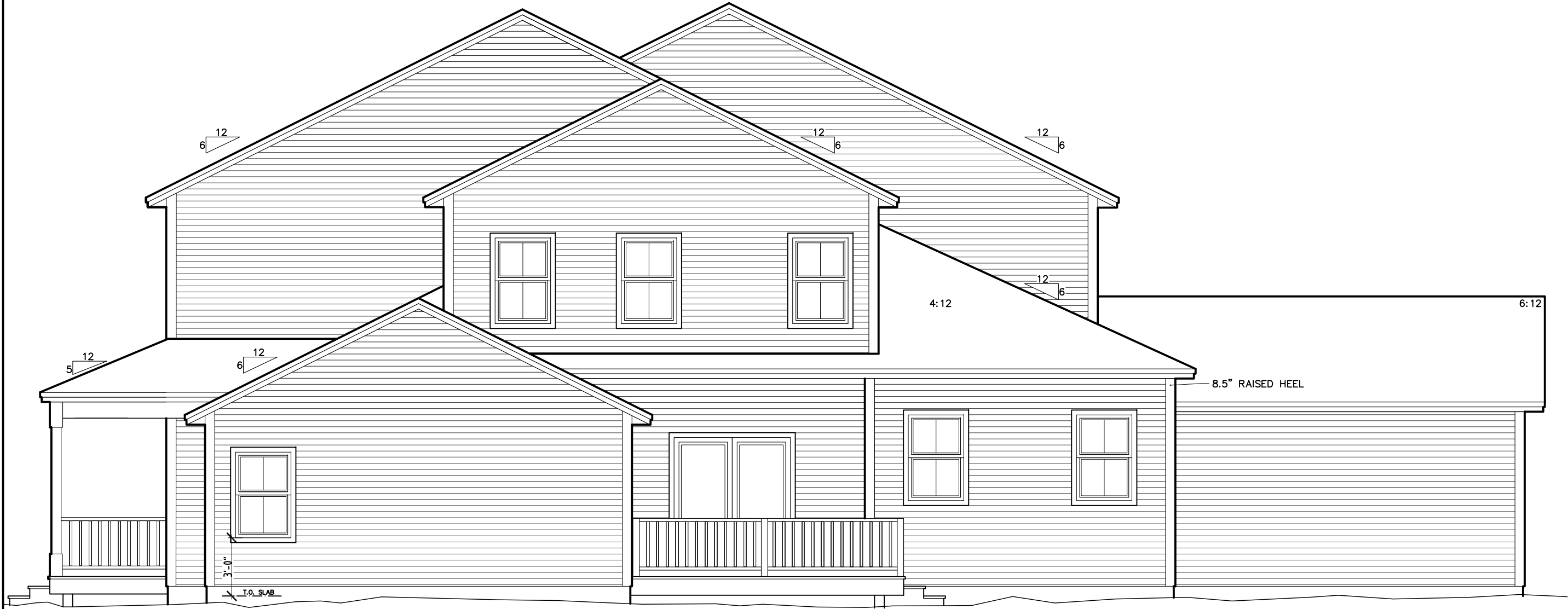
○ RIGHT ELEVATION SCALE: 3/16" = 1'-0"