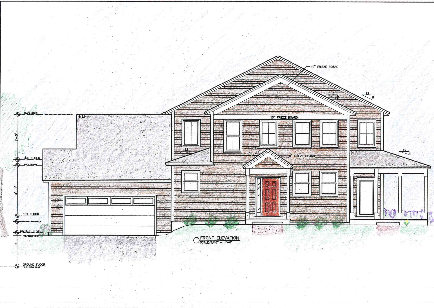
○ FRONT ELEVATION SCALE: 3/16" = 1'-0"