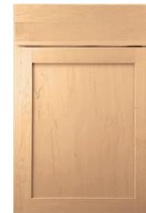
Concord Maple "Natural" Finish

**Photos are meant to show cabinet style only, actual color may vary