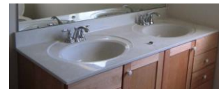
Master Bath Top

Location: Master Bathroom 72" vanity Style: Cultured Marble with 2 integrated bowls Color: White with White Bowl Edge Detail: Square Edge Cut-Outs: None Backsplash: Yes B/S Location: Back only.