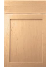
Concord Maple "Natural" Finish

**Photos are meant to show cabinet style only, actual color may vary