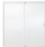
Dining to Deck III