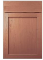
Concord Maple " #Suede " Finish