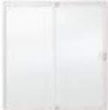
Dining to Deck III