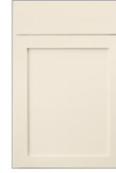
Concord Maple " #Antique White " Finish

Cabinet plans are drawn and presented to the client before cabinet construction begins. **Photos are meant to show cabinet style only, actual color may vary