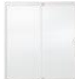
Dining to Deck III