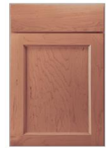
Concord Maple #Suede Finish