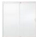
Dining to Deck III