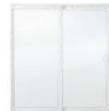
Dining to Deck IV