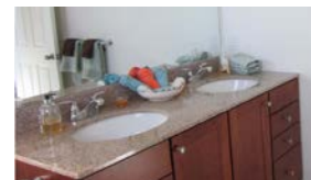
Master Bath Top

Location: Master Bathroom 72" vanity Style: International Granite Color: Wheat Edge Detail: Square Edge Cut-Outs: None Backsplash: Yes B/S Location: Back only.