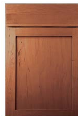
Concord Maple "Sundance" Finish

Kitchen Cabinets to be Mid Continent Simple Series All kitchen cabinets are Concord style in Maple with "Sundance" finish Vanity Cabinets to be Mid Continent Simple Series All vanity cabinets are Concord style in Maple with "Sundance" finish