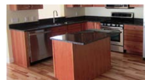
Kitchen Tops (not color, but style)

Location: Kitchen Style: Granite Color: New Caledonia Edge Detail: Pencil Edge Cut-Outs: Undermount Sink Backsplash: Yes B/S Location: Back only.