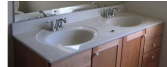
Master Bath Top

Location: Master Bathroom 72" vanity Style: Cultured Marble with 2 integrated bowls Color: White with White Bowl Edge Detail: Square Edge Cut-Outs: None Backsplash: Yes B/S Location: Back only.