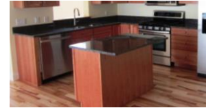
Kitchen Tops (not color, but style)

Location: Kitchen Style: Granite Color: New Caledonia Edge Detail: Pencil Edge Cut-Outs: Undermount Sink Backsplash: Yes B/S Location: Back only.