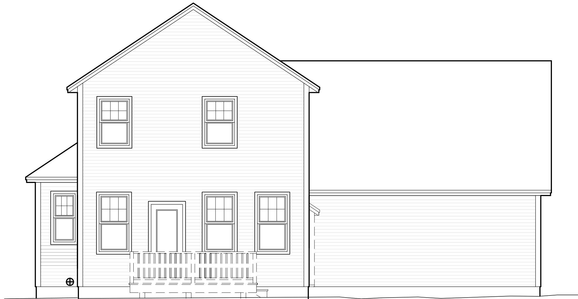
○ REAR ELEVATION SCALE: 3/16" = 1'-0"