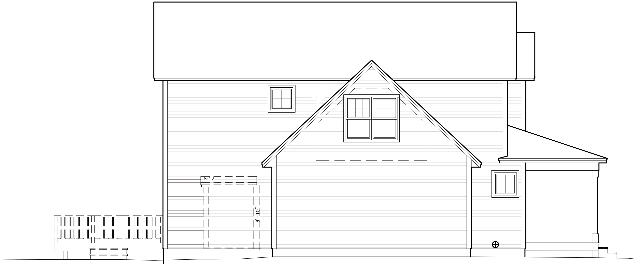
○ LEFT ELEVATION SCALE: 3/16" = 1'-0"