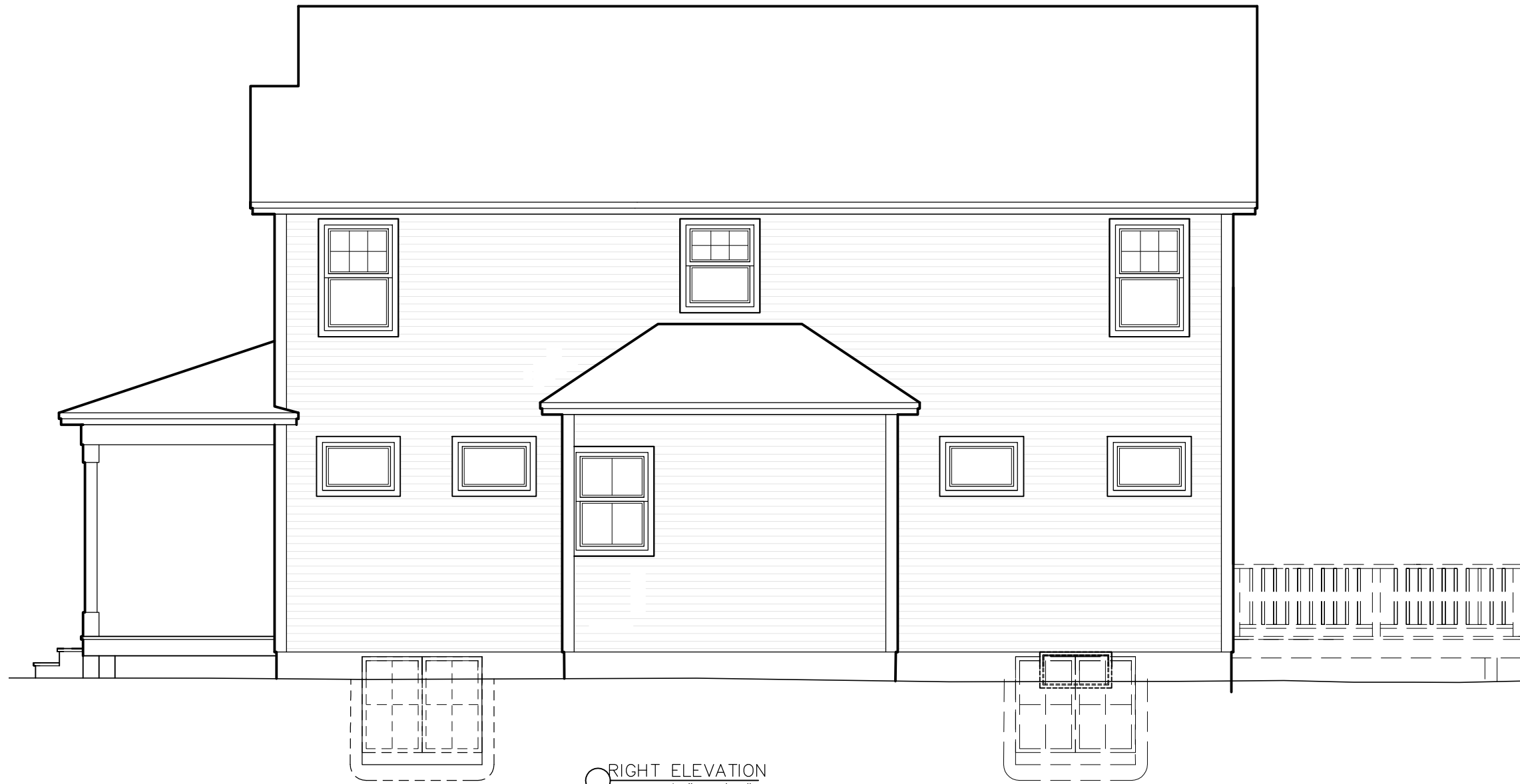
RIGHT ELEVATION SCALE: 3/16" = 1'-0"