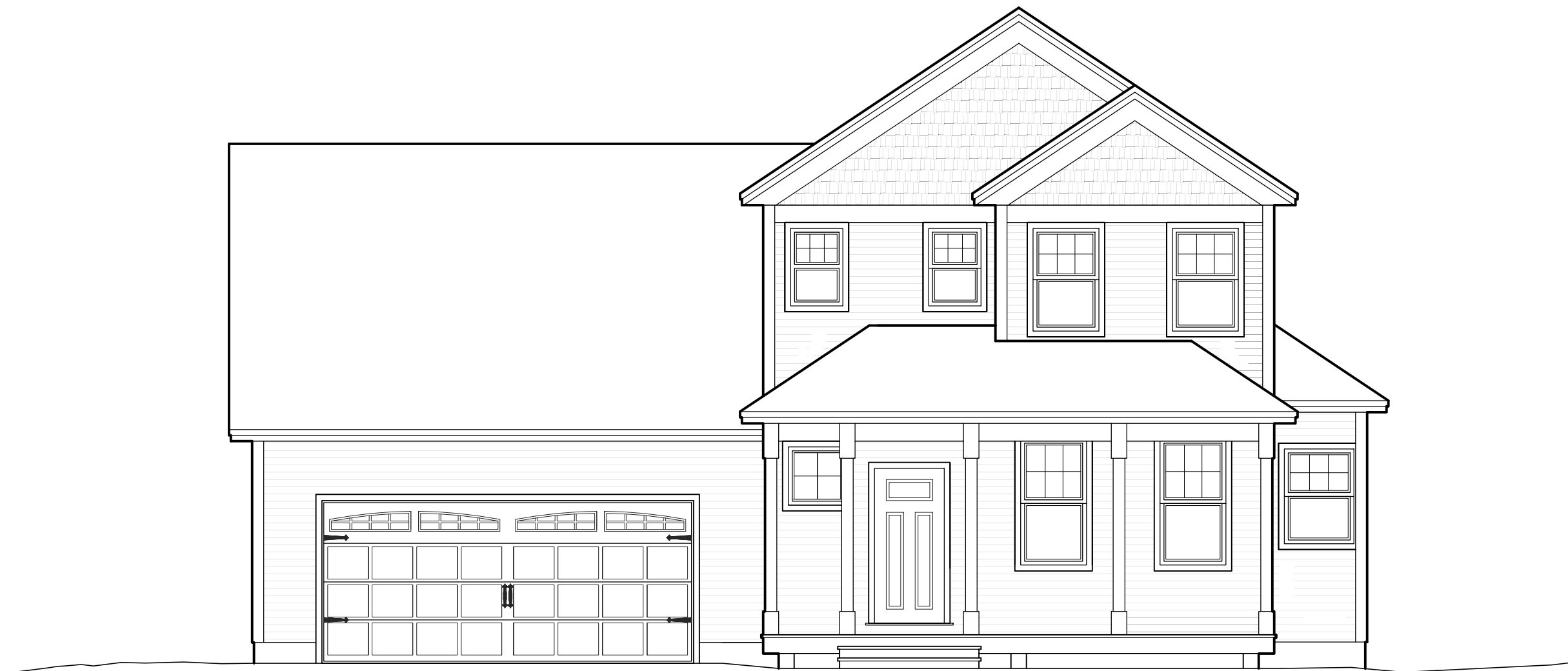
○ FRONT ELEVATION SCALE: 3/16" = 1'-0"